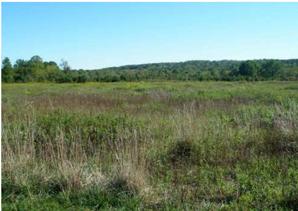
The Princeton Ridge seen from Van Horne Park in Rocky Hill

Conservation partners, including the New Jersey Conservation Foundation, Stony Brook-Millstone Watershed Association, Friends of Princeton Open Space, Open Space Institute, Princeton Township, and Mercer County are collaborating to try and create a "Princeton Ridge Preserve." Kingston Greenways Association seeks to join these preservation partners in the protection of the Ricciardi Tract, which is a critical piece of property needed to link other open space parcels together. This tract, along with other open space areas that are part of the proposed preserve, could help to form a continuous greenbelt that extends into Kingston, connecting with the D&R Canal State Park, Rockingham State Historic Site, and the Kingston Trap Rock Quarry. These are all underlain by the same diabase formation that makes up the "Princeton" ridge, locally known as the Kingston/Rocky Hill Ridge.