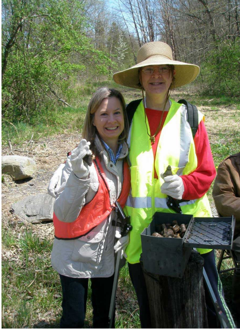
Earth Day Cleanup, Cook Natural Area