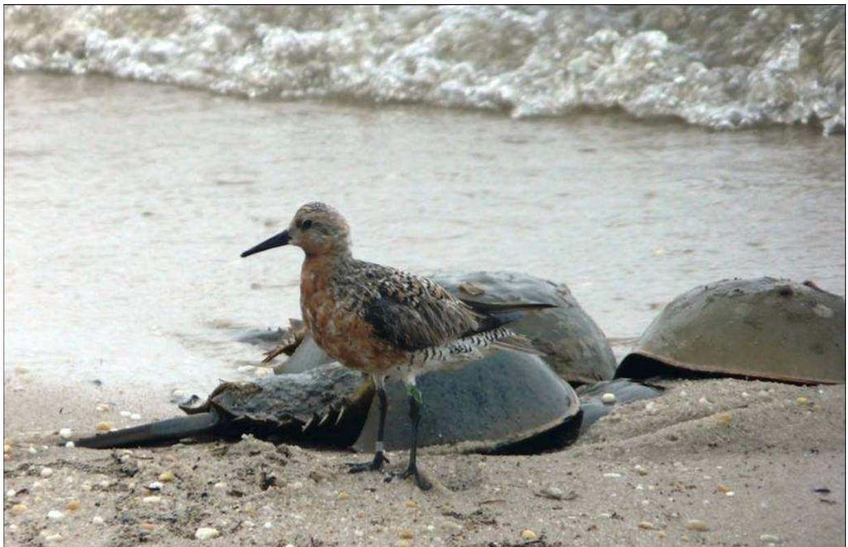
Red knot and horseshoe crabs

For the first time, KGA will be showing a movie! The PBS documentary “Crash: A Tale of Two Species” explores a fascinating, endangered relationship. This episode of "Nature" studies