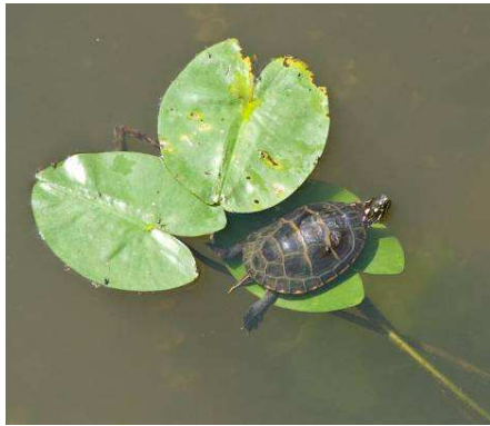
Eastern Painted Turtle